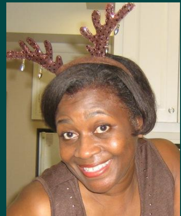
In my lighter, blessed moments!

In one of the lighter moments of the evening, our district leaders presented me with a basket of cleaning supplies! Yes, the Christmas plunger, rubber gloves, WD 40, a lighter, glass cleaner, flash lights, and building tools. A beautiful plant and cotton candy were included for 'aesthetic and appetite' inspiration. All of these were considered essentials items necessary for cleaning up issues and building transforming ministry in the district. The gift basket was capped with a music CD with the head of the body pictured bearing a strong resemblance to a DS we all know. And no the CD title was not a rendition of Onward, Christian Soldiers!